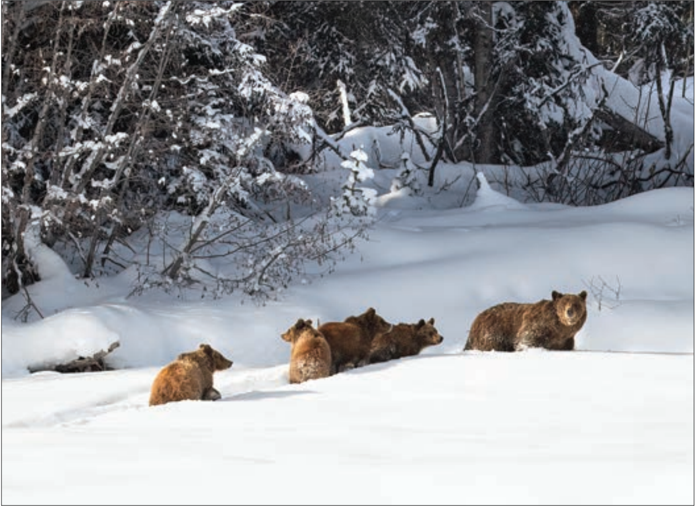
Mother Grizzly 399 and cubs going to den in winter